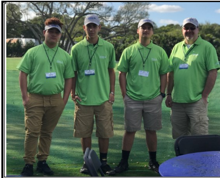
Oleta West- Dade Chapter Of DeMolay